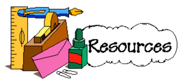
Response To Intervention (RTI)

Special programs are provided to assist students in grades Pre-K-5 who require additional support in order to succeed. Each Georgia public school has a Response to intervention (RTI) Team composed of teachers, administrators, counselors, psychologists, parents, and/or others who are involved in the education of our children. The purpose of the RTI team is to develop appropriate interventions and strategies for students who are experiencing difficulties related to school. Please contact your child's teacher for more information concerning the RTI process.